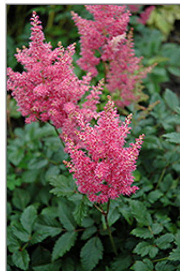
Rheinland Astilbe flowers

Rheinland Astilbe is recommended for the following landscape applications;