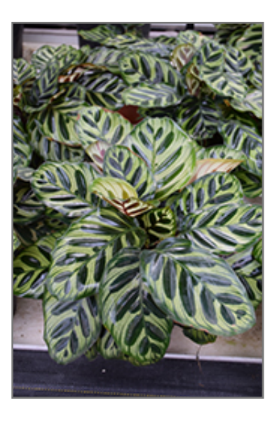
Peacock Plant in full

When grown indoors, Peacock Plant can be expected to grow to be about 24 inches tall at maturity, with a spread of 18 inches. It grows at a slow rate, and under ideal conditions can be expected to live for approximately 5 years. This houseplant should only be grown away from direct sunlight or in a room with strong artificial light. It does best in average to evenly moist soil, but will not tolerate standing water. The surface of the soil shouldn't be allowed to dry out completely, and so you should expect to water this plant once and possibly even twice each week. Be aware that your particular watering schedule may vary depending on its location in the room, the pot size, plant size and other conditions; if in doubt, ask one of our experts in the store for advice. It is not particular as to soil pH, but grows best in rich soil. Contact the store for specific recommendations on pre-mixed potting soil for this plant.