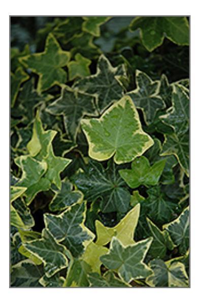
Gold Child Ivy foliage

When grown indoors, Gold Child Ivy can be expected to grow to be about 10 feet tall at maturity, with a spread of 3 feet. It grows at a medium rate, and under ideal conditions can be expected to live for approximately 30 years. This houseplant performs well in both bright or indirect sunlight and strong artificial light, and can therefore be situated in almost any well-lit room or location. It prefers to grow in average to moist soil. The surface of the soil shouldn't be allowed to dry out completely, and so you should expect to water this plant once and possibly even twice each week. Be aware that your particular watering schedule may vary depending on its location in the room, the pot size, plant size and other conditions; if in doubt, ask one of our experts in the store for advice. It is not particular as to soil pH, but grows best in rich soil. Contact the store for specific recommendations on pre-mixed potting soil for this plant. Be warned that parts of this plant are known to be toxic to humans and animals, so special care should be exercised if growing it around children and pets.