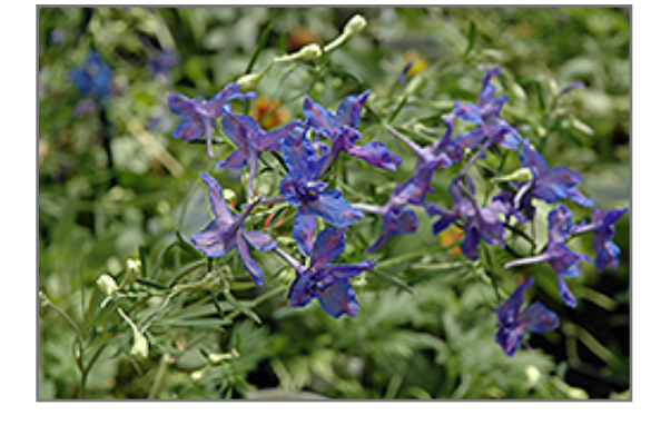
Blue Butterfly Delphinium flowers