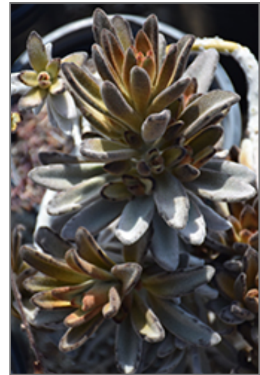
Chocolate Soldier Panda Plant

This is an herbaceous evergreen houseplant with a mounded form. This plant may benefit from an occasional pruning to look its best.