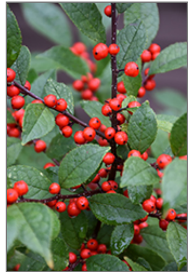
Scarlett O'Hara Winterberry fruit