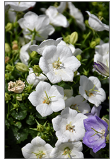
Rapido White Bellflower flowers