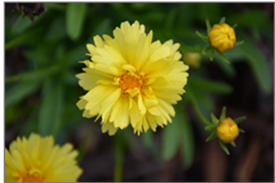
Leading Lady Charlize Tickseed flowers

Leading Lady Charlize Tickseed is recommended for the following landscape applications;