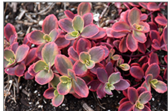
Sunsparkler Wildfire Stonecrop foliage