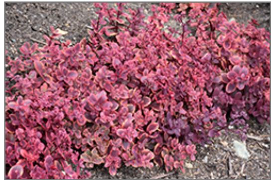
Sunsparkler Wildfire Stonecrop