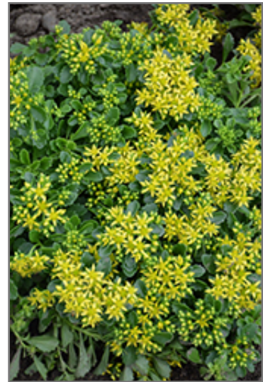
Little Miss Sunshine Stonecrop flowers

Little Miss Sunshine Stonecrop is recommended for the following landscape applications;