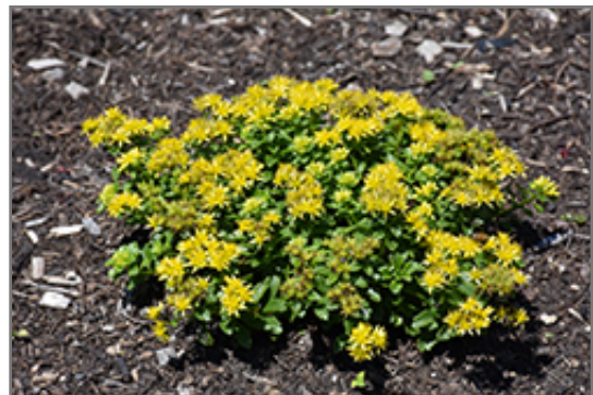
Little Miss Sunshine Stonecrop in bloom