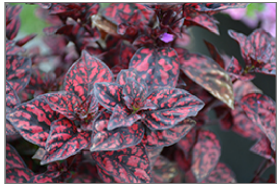
Hippo Red Polka Dot Plant foliage

Hippo Red Polka Dot Plant is recommended for the following landscape applications;