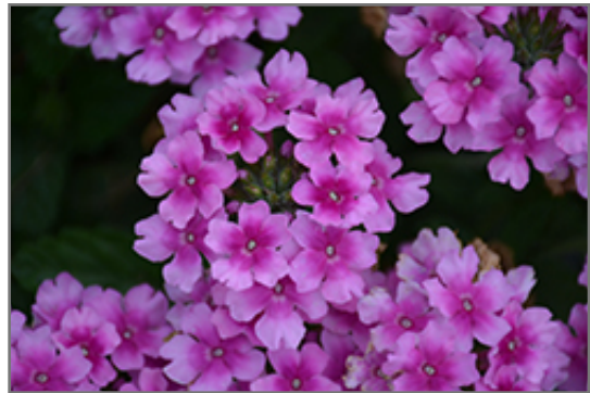
EnduraScape Pink Bicolor Verbena flowers

EnduraScape Pink Bicolor Verbena is an herbaceous annual with a trailing habit of growth, eventually spilling over the edges of hanging baskets and containers. It brings an extremely fine and delicate texture to the garden composition and should be used to full effect.