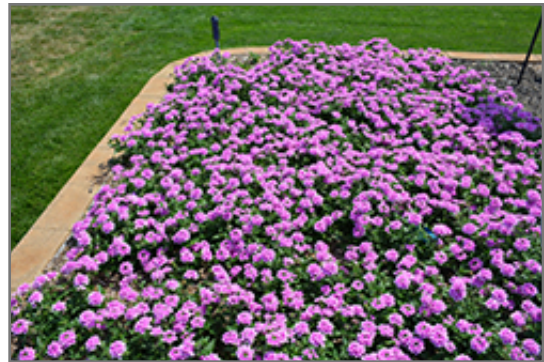
EnduraScape Pink Bicolor Verbena in bloom