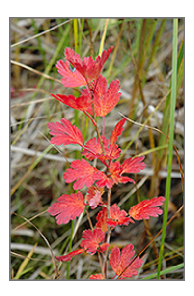
American Gooseberry in fall