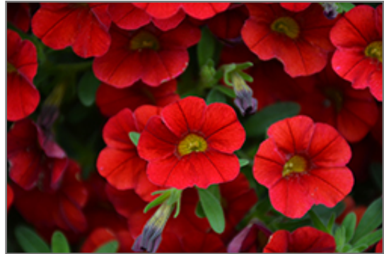
MiniFamous Neo Vampire Calibrachoa flowers

MiniFamous Neo Vampire Calibrachoa is a dense herbaceous annual with a trailing habit of growth, eventually spilling over the edges of hanging baskets and containers. Its medium texture blends into the garden, but can always be balanced by a couple of finer or coarser plants for an effective composition.