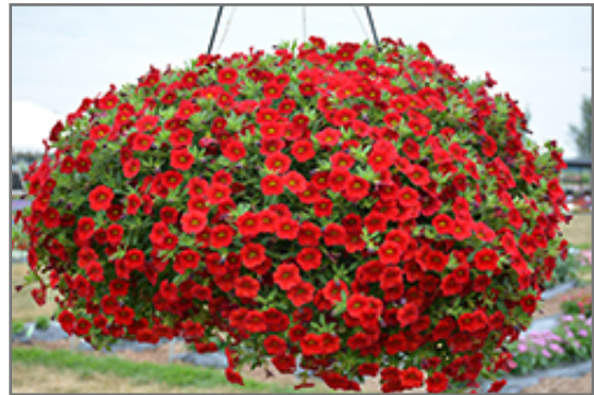
MiniFamous Neo Vampire Calibrachoa in bloom