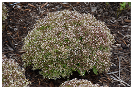
Rock 'N Round Bundle Of Joy Stonecrop in bloom