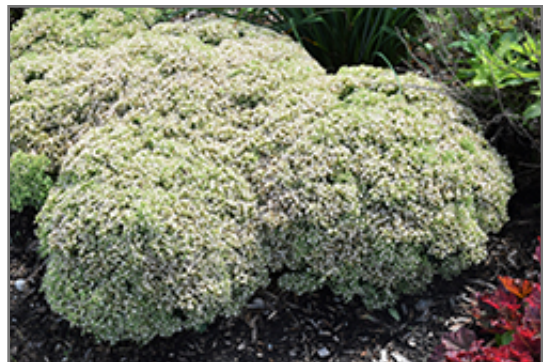
Rock 'N Round Bundle Of Joy Stonecrop in bloom

Rock 'N Round Bundle Of Joy Stonecrop is a dense herbaceous perennial with a mounded form. Its medium texture blends into the garden, but can always be balanced by a couple of finer or coarser plants for an effective composition.