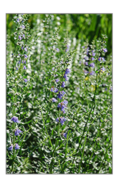
Hyssop flowers

Aside from its primary use as an edible, Hyssop is sutiable for the following landscape applications;