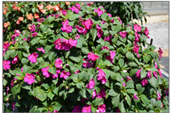
Beacon Violet Shades Impatiens in bloom

Beacon Violet Shades Impatiens will grow to be about 15 inches tall at maturity, with a spread of 12 inches. When grown in masses or used as a bedding plant, individual plants should be spaced approximately 8 inches apart. Its foliage tends to remain dense right to the ground, not requiring facer plants in front. This fast-growing annual will normally live for one full growing season, needing replacement the following year.