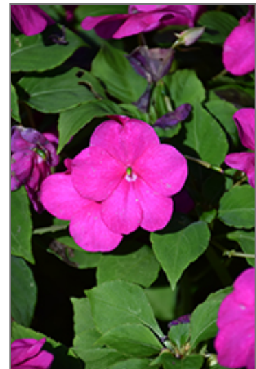
Beacon Violet Shades Impatiens flowers