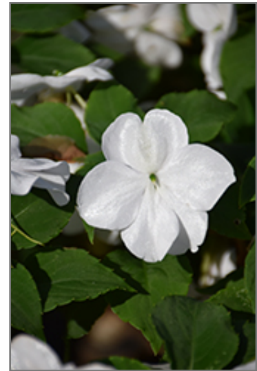
Beacon White Impatiens flowers

Beacon White Impatiens is recommended for the following landscape applications;