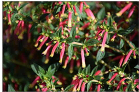
Honeybells Cuphea flowers