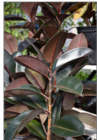
Burgundy Rubber Tree foliage