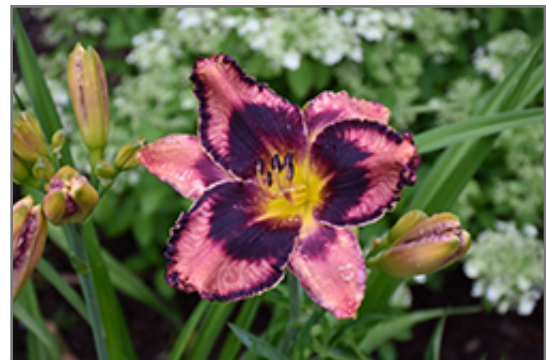
Rainbow Rhythm Storm Shelter Daylily flowers