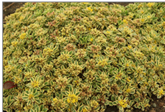
Rock 'N Low Boogie Woogie Stonecrop flowers

Rock 'N Low Boogie Woogie Stonecrop is a dense herbaceous perennial with a mounded form. Its medium texture blends into the garden, but can always be balanced by a couple of finer or coarser plants for an effective composition.