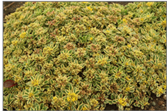
Rock 'N Low Boogie Woogie Stonecrop flowers

Rock 'N Low Boogie Woogie Stonecrop is a dense herbaceous perennial with a mounded form. Its medium texture blends into the garden, but can always be balanced by a couple of finer or coarser plants for an effective composition.