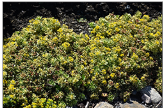
Rock 'N Low Boogie Woogie Stonecrop in bloom