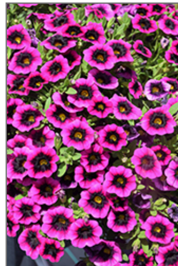
Superbells Blackcurrent Punch Calibrachoa flowers

This plant will require occasional maintenance and upkeep. Trim off the flower heads after they fade and die to encourage more blooms late into the season. It is a good choice for attracting bees and hummingbirds to your yard, but is not particularly attractive to deer who tend to leave it alone in favor of tastier treats. It has no significant negative characteristics.