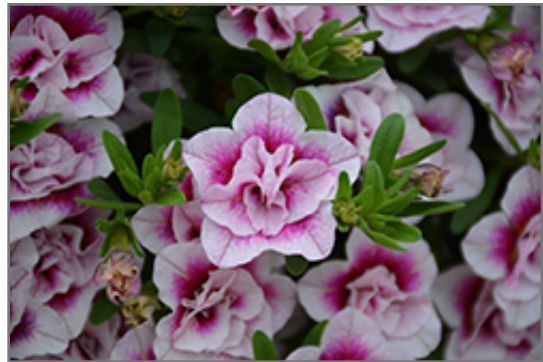
MiniFamous Uno Double PinkTastic Calibrachoa flowers

MiniFamous Uno Double PinkTastic Calibrachoa is a dense herbaceous annual with a trailing habit of growth, eventually spilling over the edges of hanging baskets and containers. Its medium texture blends into the garden, but can always be balanced by a couple of finer or coarser plants for an effective composition.