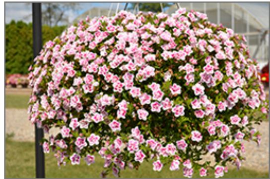
MiniFamous Uno Double PinkTastic Calibrachoa in bloom