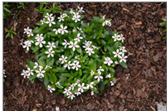
Soiree Kawaii White Peppermint Vinca in bloom