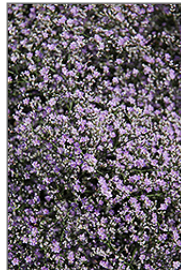
Sea Lavender flowers