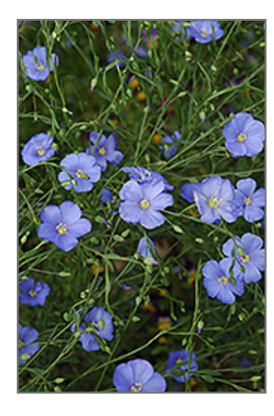
Perennial Flax flowers