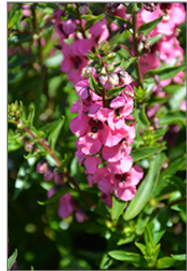
Serena Rose Angelonia flowers

This plant will require occasional maintenance and upkeep, and should not require much pruning, except when necessary, such as to remove dieback. It is a good choice for attracting bees and butterflies to your yard, but is not particularly attractive to deer who tend to leave it alone in favor of tastier treats. It has no significant negative characteristics.