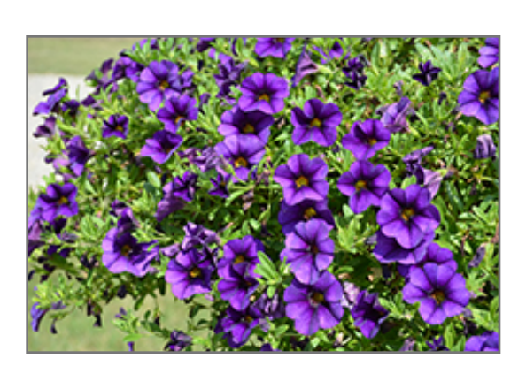
MiniFamous Uno Dark Blue Calibrachoa flowers