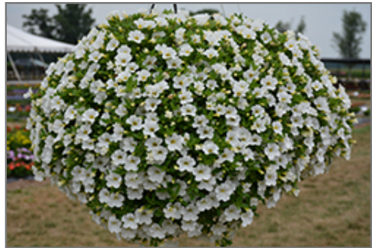
MiniFamous Uno White Calibrachoa in bloom

MiniFamous Uno White Calibrachoa is a fine choice for the garden, but it is also a good selection for planting in outdoor containers and hanging baskets. Because of its trailing habit of growth, it is ideally suited for use as a 'spiller' in the 'spiller-thriller-filler' container combination; plant it near the edges where it can spill gracefully over the pot. Note that when growing plants in outdoor containers and baskets, they may require more frequent waterings than they would in the yard or garden.