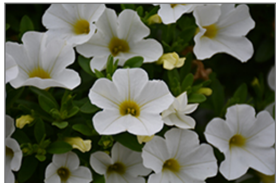
MiniFamous Uno White Calibrachoa flowers