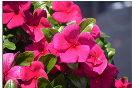
Cora XDR Hotgenta flowers

This plant will require occasional maintenance and upkeep, and should not require much pruning, except when necessary, such as to remove dieback. It is a good choice for attracting butterflies to your yard, but is not particularly attractive to deer who tend to leave it alone in favor of tastier treats. It has no significant negative characteristics.