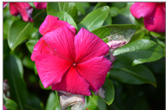
Cora XDR Hotgenta flowers