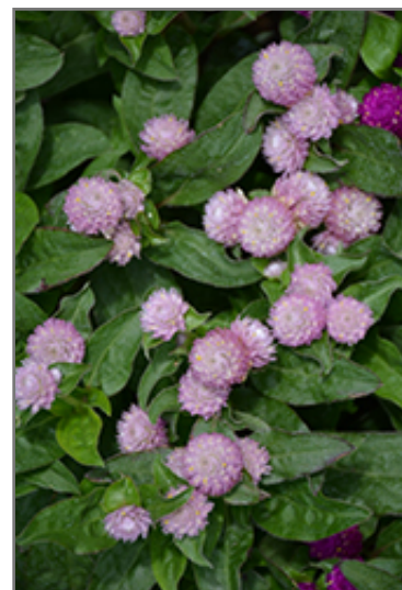
Ping Pong Lavender Globe Amaranth flowers