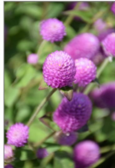
Ping Pong Lavender Globe Amaranth flowers

Ping Pong Lavender Globe Amaranth is recommended for the following landscape applications;