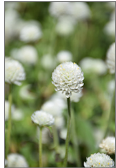
Ping Pong White Globe Amaranth flowers

Ping Pong White Globe Amaranth is recommended for the following landscape applications;