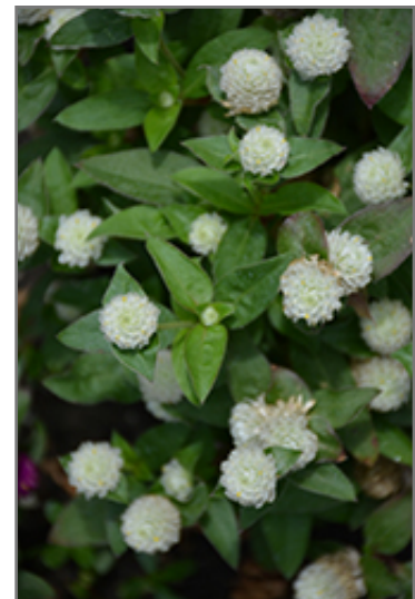
Ping Pong White Globe Amaranth flowers