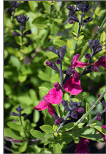
Vibe Ignition Fuchsia Sage flowers

Vibe Ignition Fuchsia Sage is a fine choice for the garden, but it is also a good selection for planting in outdoor pots and containers. With its upright habit of growth, it is best suited for use as a 'thriller' in the 'spiller-thriller-filler' container combination; plant it near the center of the pot, surrounded by smaller plants and those that spill over the edges. Note that when growing plants in outdoor containers and baskets, they may require more frequent waterings than they would in the yard or garden. Be aware that in our climate, this plant may be too tender to survive the winter if left outdoors in a container. Contact our experts for more information on how to protect it over the winter months.