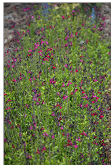
Vibe Ignition Fuchsia Sage in bloom