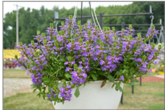
Purple Haze Fan Flower in bloom

Purple Haze Fan Flower is a fine choice for the garden, but it is also a good selection for planting in outdoor containers and hanging baskets. It is often used as a 'filler' in the 'spiller-thriller-filler' container combination, providing a mass of flowers against which the larger thriller plants stand out. Note that when growing plants in outdoor containers and baskets, they may require more frequent waterings than they would in the yard or garden.