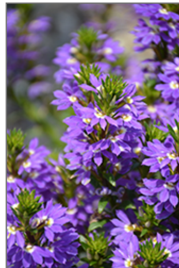
Purple Haze Fan Flower flowers

Purple Haze Fan Flower is recommended for the following landscape applications;