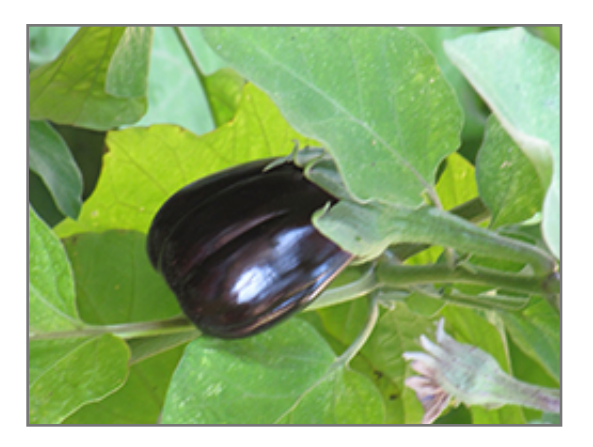
Black Beauty Eggplant fruit