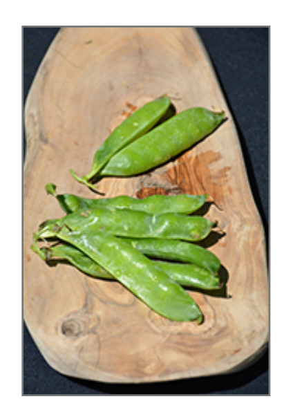
Sugar Ann Pea fruit

Sugar Ann Pea will grow to be about 18 inches tall at maturity, with a spread of 24 inches. When planted in rows, individual plants should be spaced approximately 30 inches apart. This fast-growing vegetable plant is an annual, which means that it will grow for one season in your garden and then die after producing a crop. Because of its relatively short time to maturity, it lends itself to a series of successive plantings each staggered by a week or two; this will prolong the effective harvest period.