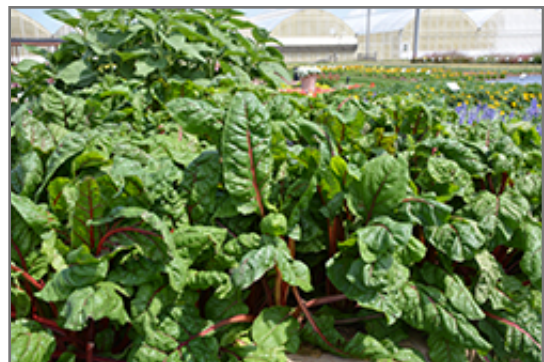
Ruby Red Swiss Chard