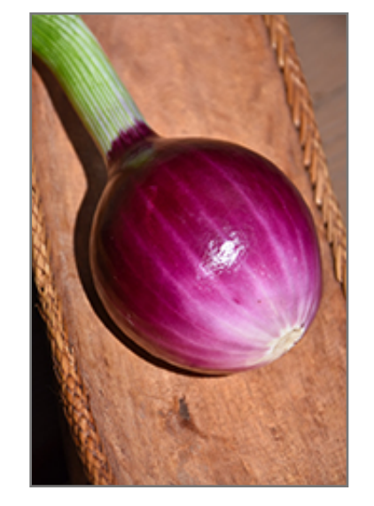
Red Onion fruit