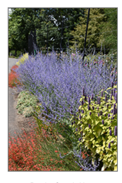
Russian Sage in bloom