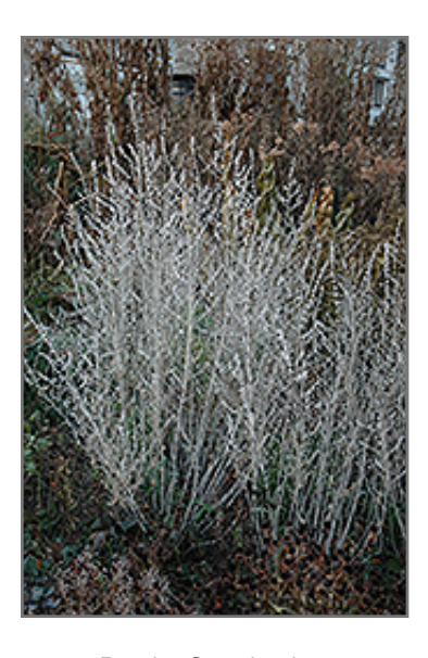
Russian Sage in winter

This plant should only be grown in full sunlight. It prefers dry to average moisture levels with very well-drained soil, and will often die in standing water. It is considered to be drought-tolerant, and thus makes an ideal choice for a low-water garden or xeriscape application. It is not particular as to soil type, but has a definite preference for alkaline soils. It is highly tolerant of urban pollution and will even thrive in inner city environments. This species is not originally from North America.