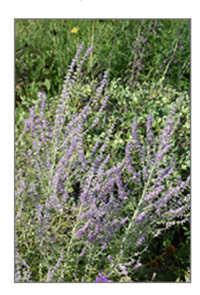
Russian Sage flowers