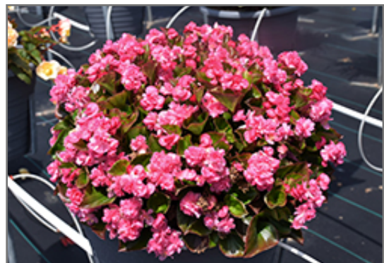
Double Up Pink Begonia in bloom