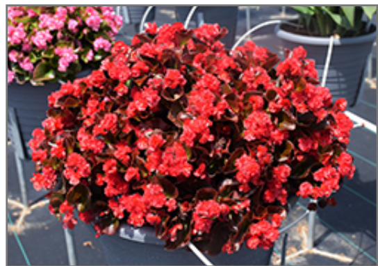
Double Up Red Begonia in bloom