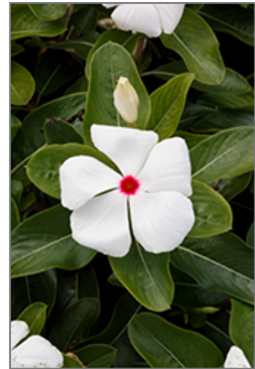
Cora Cascade Polka Dot Vinca flowers

Cora Cascade Polka Dot Vinca is recommended for the following landscape applications;