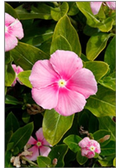
Cora Cascade Shell Pink Vinca flowers

Cora Cascade Shell Pink Vinca is recommended for the following landscape applications;