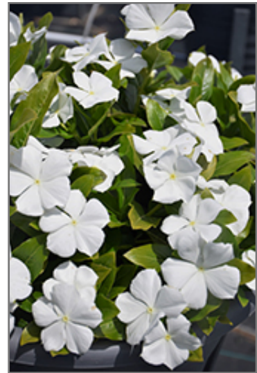
Cora Cascade White Vinca flowers

Cora Cascade White Vinca is recommended for the following landscape applications;