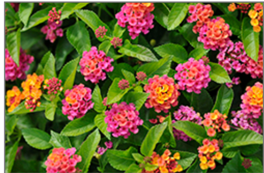
Bloomify Rose Lantana flowers

This is a relatively low maintenance plant, and should not require much pruning, except when necessary, such as to remove dieback. It is a good choice for attracting bees, butterflies and hummingbirds to your yard, but is not particularly attractive to deer who tend to leave it alone in favor of tastier treats. It has no significant negative characteristics.