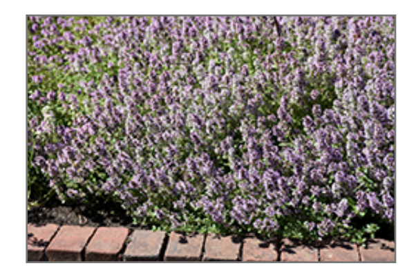
Common Thyme in bloom

Common Thyme is smothered in stunning clusters of pink flowers at the ends of the stems from early to mid summer. Its attractive tiny fragrant round leaves remain grayish green in color throughout the year.