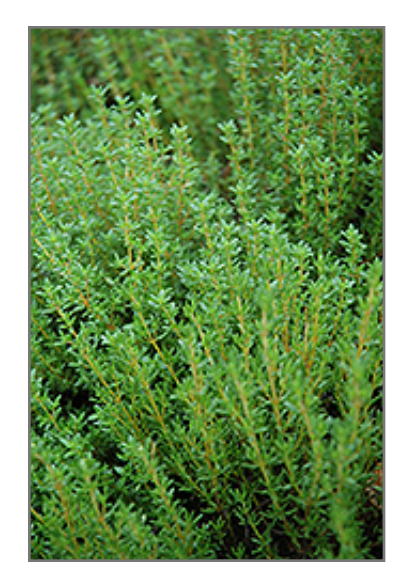
Common Thyme foliage