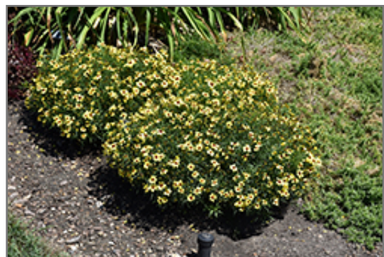
Sizzle And Spice Sassy Saffron Tickseed in bloom