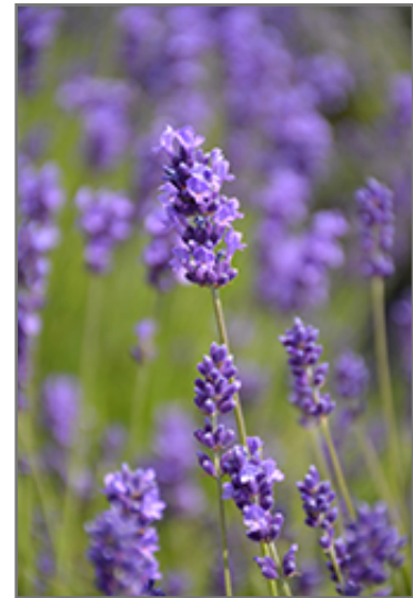
Imperial Gem Lavender flowers

Imperial Gem Lavender is recommended for the following landscape applications;