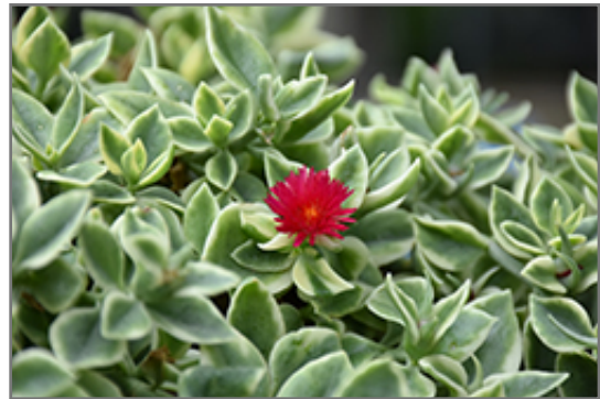
Variegated Baby Sun Rose flowers

Variegated Baby Sun Rose is recommended for the following landscape applications;